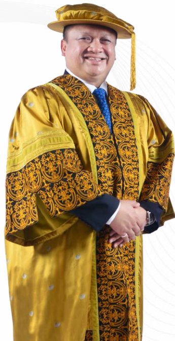
D.Y.T.M. TUANKU SYED FAIZUDDIN PUTRA IBNI TUANKU SYED SIRAJUDDIN PUTRA JAMALULLAIL D.K., S.P.M.P., P.A.T.

RAJA MUDA PERLIS / CROWN PRINCE OF PERLIS (CANSELOR / CHANCELLOR)