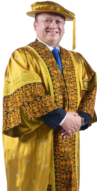
D.Y.T.M. TUANKU SYED FAIZUDDIN PUTRA IBNI TUANKU SYED SIRAJUDDIN PUTRA JAMALULLAIL D.K., S.P.M.P., P.A.T.

RAJA MUDA PERLIS / CROWN PRINCE OF PERLIS (CANSELOR / CHANCELLOR)