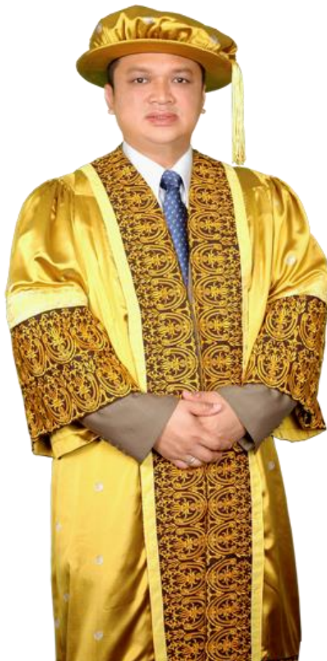
D.Y.T.M. TUANKU SYED FAIZUDDIN PUTRA IBNI TUANKU SYED SIRAJUDDIN PUTRA JAMALULLAIL D.K., S.P.M.P., P.A.T.

RAJA MUDA PERLIS / CROWN PRINCE OF PERLIS (CANSELOR UniMAP / CHANCELLOR OF UniMAP)