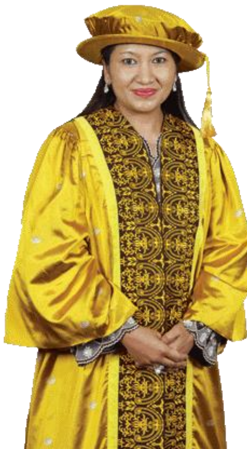
D.Y.T.M TUANKU HAJAH LAILATUL SHAHREEN AKASHAH KHALIL S.P.M.P.

RAJA PUAN MUDA PERLIS / CROWN PRINCESS OF PERLIS (PRO CANSELOR UniMAP/ PRO CHANCELLOR OF UniMAP)