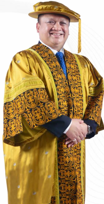
D.Y.T.M. TUANKU SYED FAIZUDDIN PUTRA IBNI TUANKU SYED SIRAJUDDIN PUTRA JAMALULLAIL D.K., S.P.M.P., P.A.T.

RAJA MUDA PERLIS / CROWN PRINCE OF PERLIS (CANSELOR / CHANCELLOR)